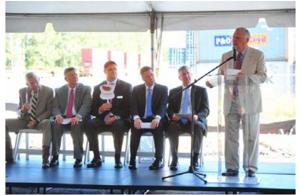
Governor Deal announced Cordele Inland Port Partnership with KIA Motors Georgia

By state law, ParkPass is required for admission/parking at Georgia Veterans State Park. $5 daily fee or annual passes are accepted during DOWT.