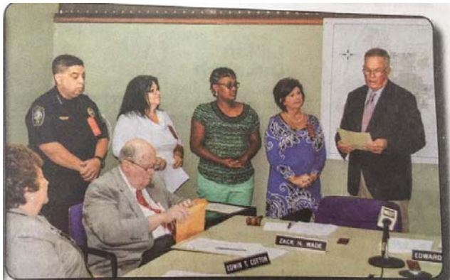
Red Ribbon Week

Proclamation approved at Cordele City Commission