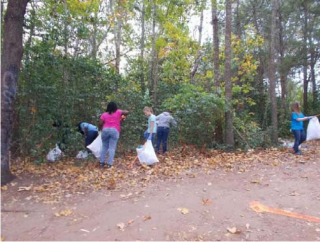
Rivers Alive & County-Wide Cleanup Day