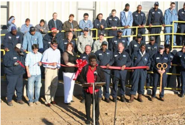
Helena Industries Warehouse E Ribbon Cutting