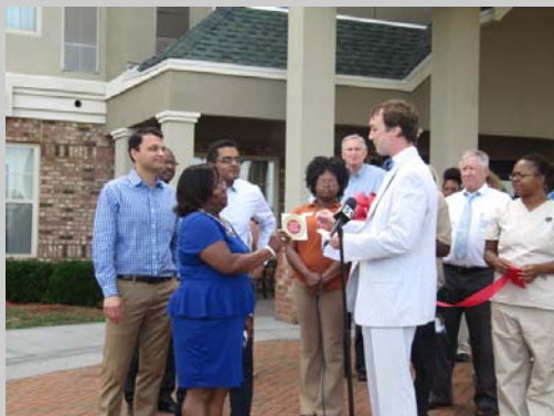
Comfort Inn & Suites