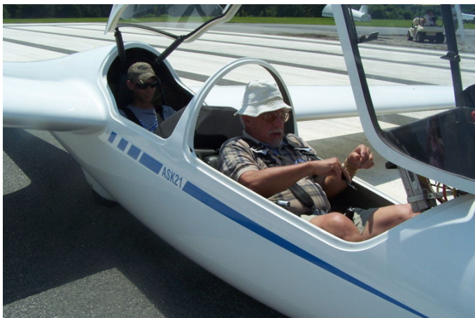
Sailplanes return to Cordele through June 6th