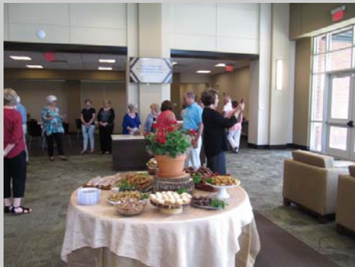
Cordele First Baptist Church