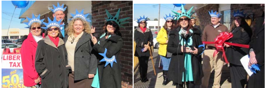
Liberty Tax Service