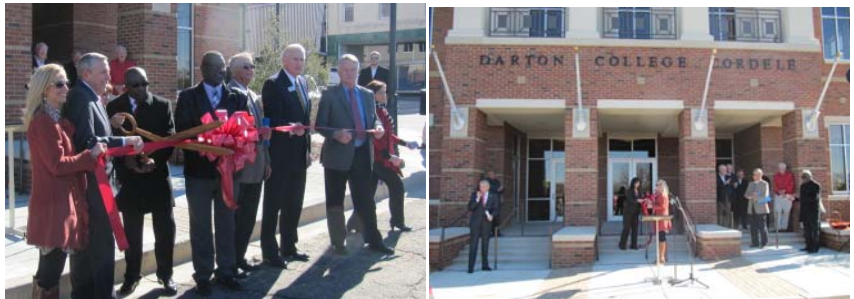
Darton College - Cordele Downtown Campus